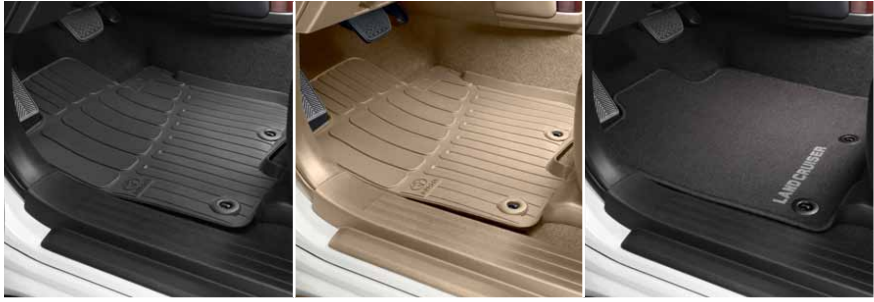
Rubber floor mats Tough protection for your car's carpets against mud, sand and dirt. The driver's mat has special safety fixings to stop it slipping. Available in black or light stone beige.

Especially made for cars with trunk floor rails. The strong plastic liner fits neatly around the rails to protect the trunk carpet against water, mud, sand and dirt.