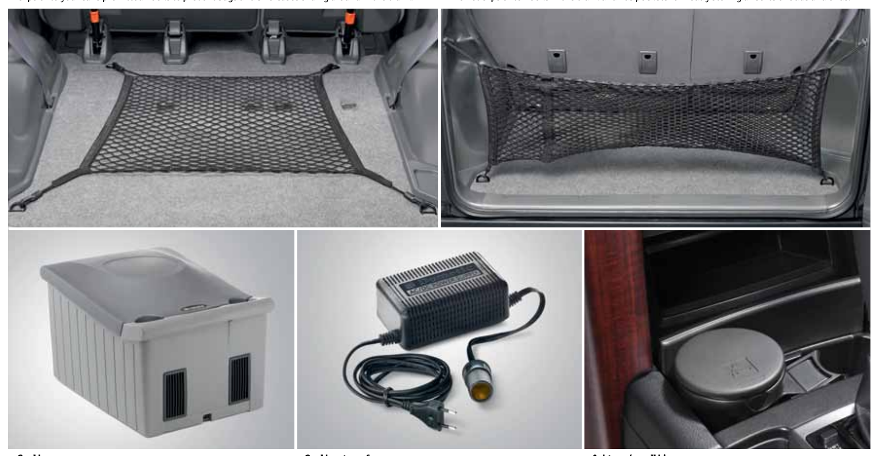
Cool box Ideal for picnics and days out. Plugs into your car's 12V socket to keep refreshments either hot or chilled.

The net clips onto hooks in the trunk and has pockets for neatly storing all sorts of odds and ends.