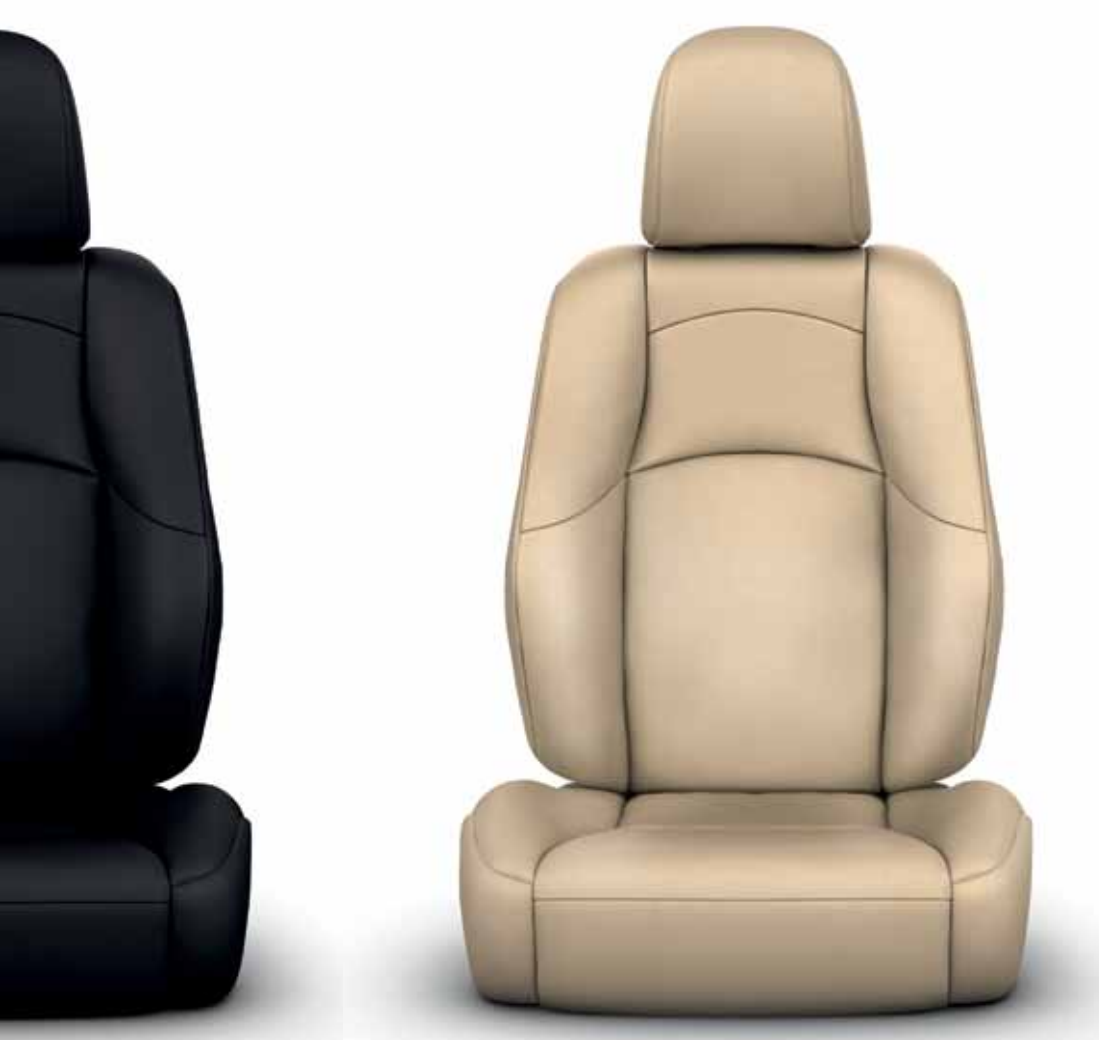
Beige leather Light stone beige leather with matching beige stitching.

Black leather High quality black leather with matching black stitching.