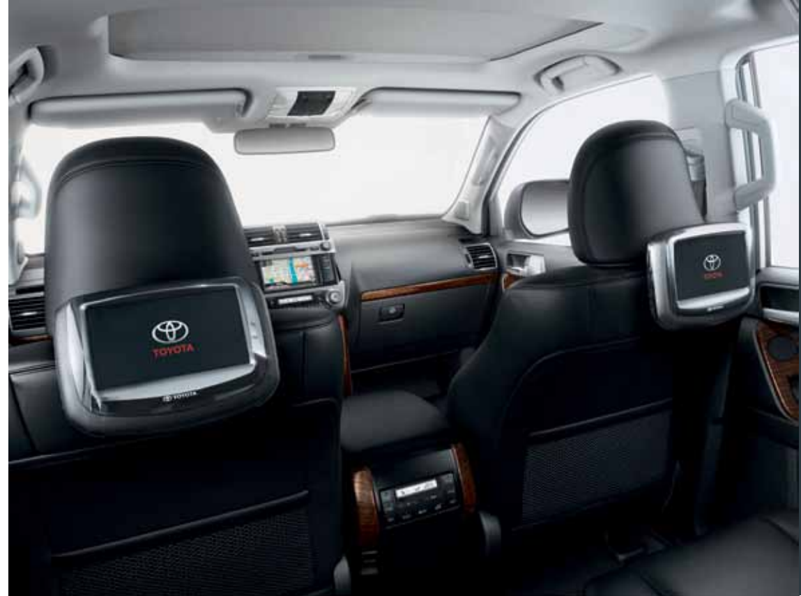
* Available from mid-November 2013. **Available from mid-December 2013. iPad® is a trademark of Apple Inc., registered in the US and other countries.

Superb stereo listening. The optional headphones have independent volume control and will automatically shut down to preserve battery life when no signal has been received for a period of time.