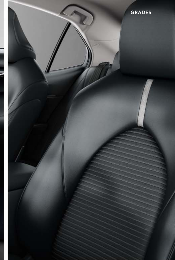
BLACK SYNTHETIC LEATHER SEATS This sporty and supportive seat trim provides the comfort of fabric with the texture of leather.