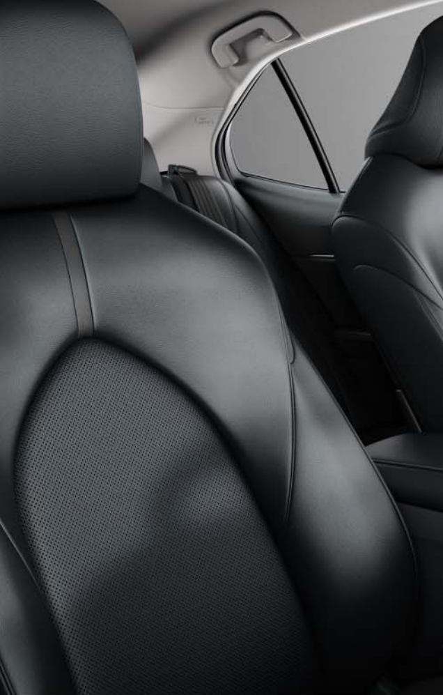
BLACK LEATHER SEATS The black leather seats with a chic herringbone pattern further enhance the sense of sophistication.