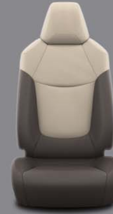
Dark brown fabric with beige inserts Standard on Active