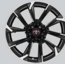
18" bi-tone black and machined-face alloy wheels (5-double-spoke)§ Optional on GR SPORT

* Not available on 1.5 l TNGA Petrol M/D S.