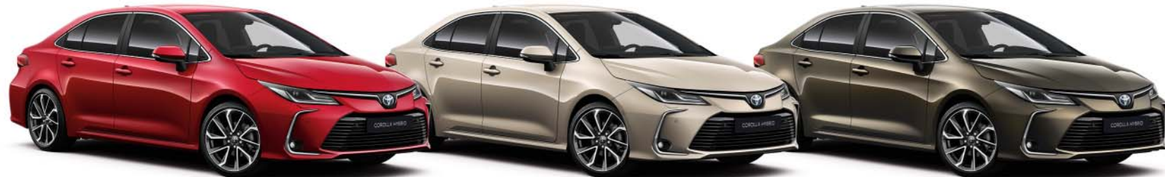
3U5 Flame Red*