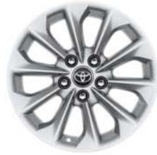
16" alloy wheels (10-spoke) Standard on Hybrid Mid, Mid