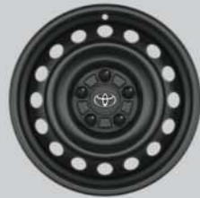
16" steel wheels with wheel caps Optional on all grades