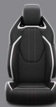
Grey fabric with black leather-like bolsters & satin chrome ornament Standard on GR SPORT