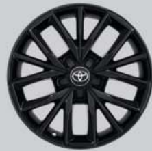
17" black alloy wheels (5-triple-spoke) Optional on all grades