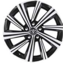
17" machined-face alloy wheels (5-double-spoke)* Standard on Style, optional on High