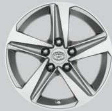
16" silver alloy wheels (5-spoke) Optional on all grades