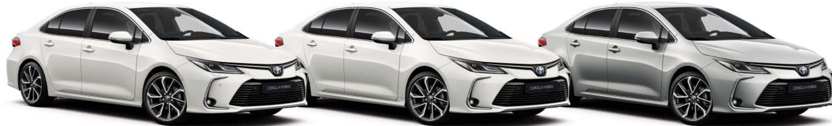
040 Pure White