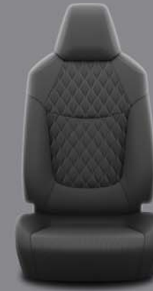
Black fabric with quilted inserts Standard on Hybrid Live, Hybrid Mid, Hybrid Style, Mid, Style