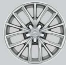
17" silver alloy wheels (5-triple-spoke) Optional on all grades