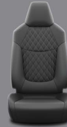
Black partial leather with beige stitching Standard on Hybrid High, High