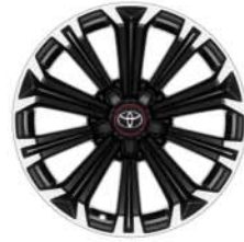
17" machined-face alloy wheels (10-spoke) Standard on GR SPORT