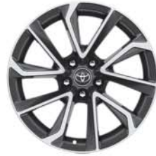
18" bi-tone grey & machined-face alloy wheels (5-double-spoke)§ Standard on High, optional on Hybrid High