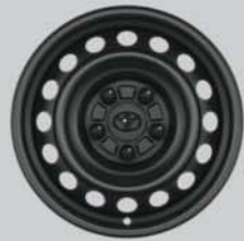
15" steel wheels with wheel caps Optional on all grades