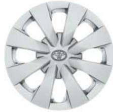
15" steel wheels with wheel caps (8-spoke) Standard on Hybrid Live, Active