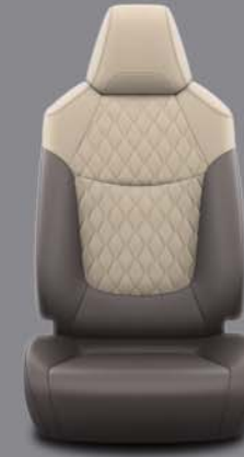
Dark brown partial leather with beige stitching Standard on Hybrid High, High