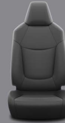
Black fabric Standard on Active