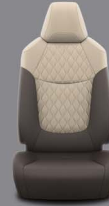
Dark brown fabric with beige quilted inserts Standard on Hybrid Live, Hybrid Mid, Hybrid Style, Mid, Style