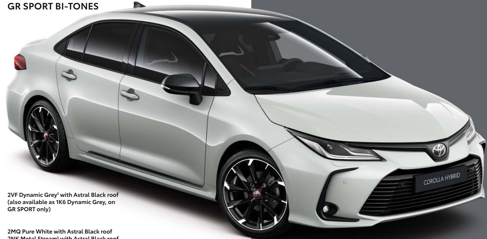
2VF Dynamic Grey§ with Astral Black roof (also available as 1K6 Dynamic Grey, on GR SPORT only)