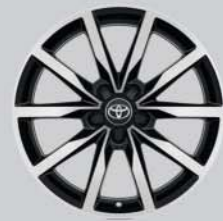
18" black machined-face alloy wheels (5-double-spoke) Optional on all grades