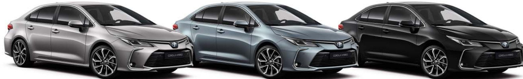
1K0 Metal Stream§